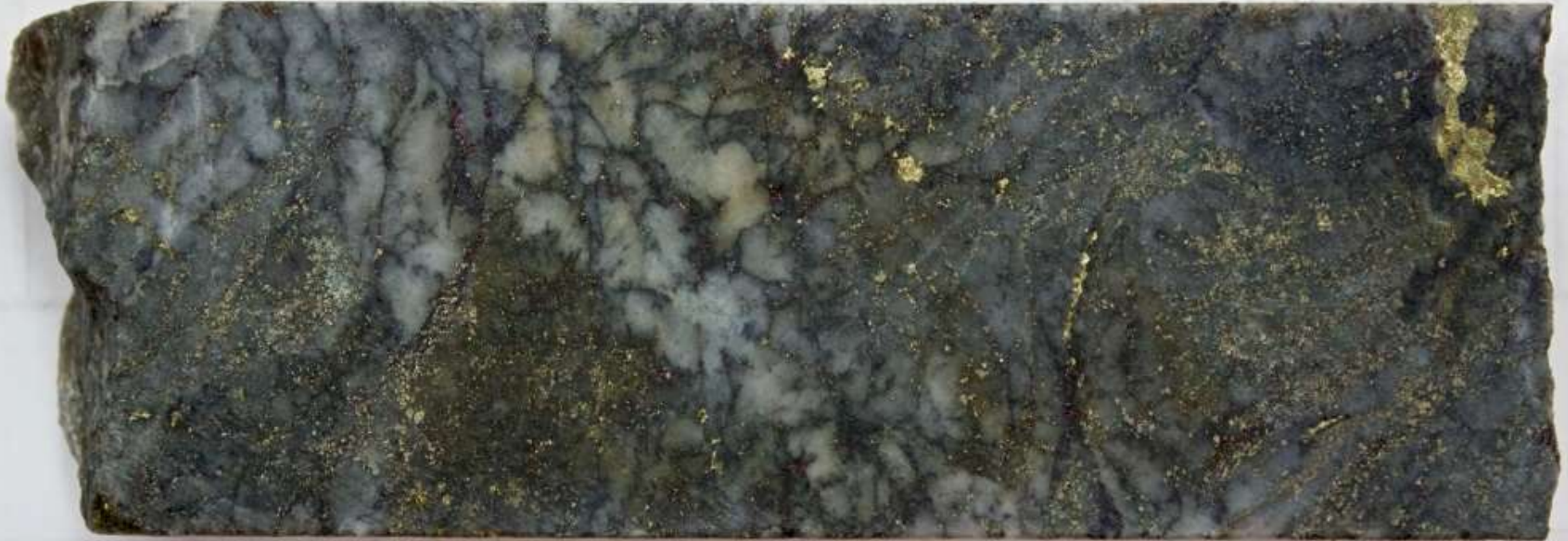
Bornite-chalcopyrite stockwork veining