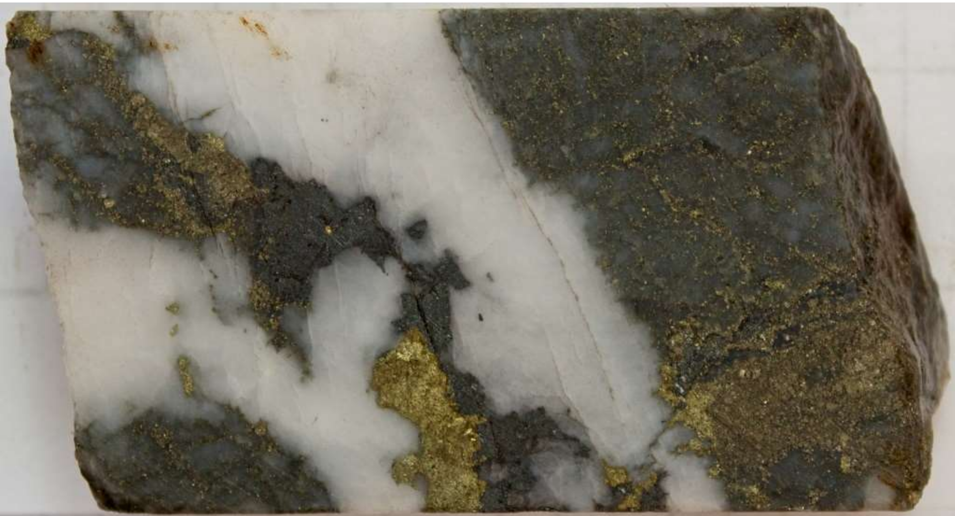
Close up of chalcopyrite-bornite bearing quartz vein