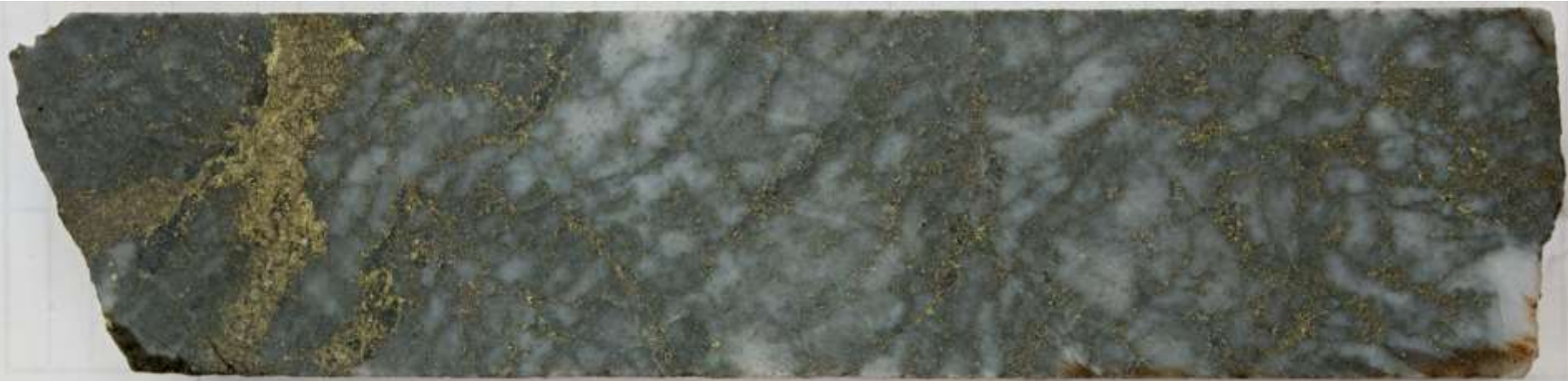
bornite-chalcopyrite stockwork veining