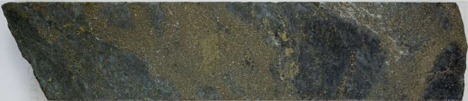
Chalcopyrite veins in chalcopyrite-bornite stockwork veining